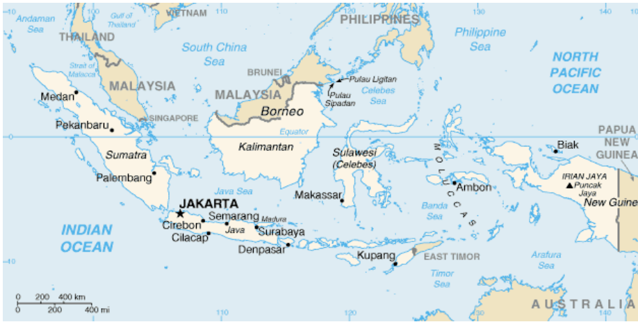
Map of Indonesia

These on-going conflicts reflect the fact that Indonesia's policy focus clearly prioritises large-scale infrastructure and real estate development as well as dirty coal-based energy, all of which have serious social and environmental consequences that cannot be resolved by MSP. Fishers and coastal communities, many of whom have been living in these areas for generations, are legitimate rights holders in these territories. 3 Yet their rights are being violated and thousands of people are being forced into desperate conditions as their land and waters are grabbed for other uses and/or pollution and environmental degradation undermine their livelihoods.