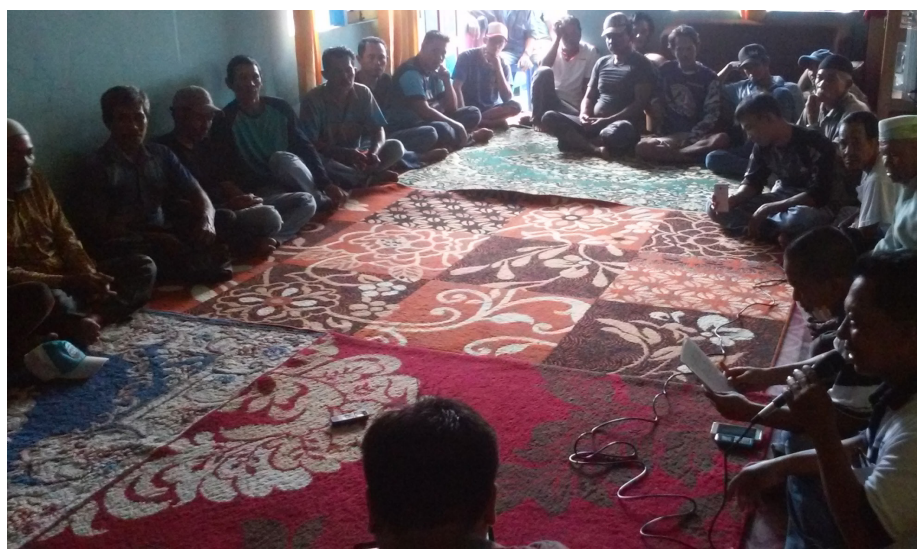
KNTI organizing fishing communities to help them making their human rights recognized, North Kalimantan, May 2018

As a result, conflicts that emerge today are not only between government agencies (for example about whether to create a mining or a conservation area), but also between different scales of government (for example between district and provincial governments) with overlapping mandates for the same coastal and ocean spaces. In other words, very often, the state is actually in conflict with itself within and between different scales of government.