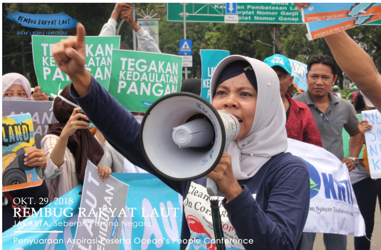
Protest in front of the Presidential palace during the Ocean's People Conference in Jakarta, 30th October 2018

charge of making decisions about access to and control of ocean space? How should it be managed? In fact, as part of the World Forum of Fisher Peoples' KNTI has dedicated years of organising to contributing to the development of an alternative vision of fisheries governance, as described in the Voluntary Guidelines for Securing Sustainable Small Scale Fisheries (FAO, 2014), which would have profound impacts on ocean governance more broadly. Do these guidelines provide a viable alternative in Indonesia? What are the main barriers to their implementation? What does a Human Rights Based Approach to fisheries governance look like in the Indonesian context and what would the implications be for other ocean industries?