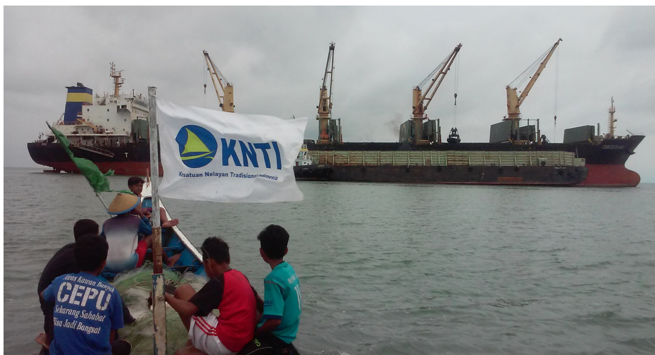
Coal transport ship entering fishing grounds, North Kalimantan.

number of tools across different scales to fight against the mining project, including international outreach campaigns, social media networking, advocacy towards the parliament, human-rights campaigns, and meetings with the president's staff. Initially the influence of the mining interests through their distinct channels - which according to local activists included bribery and a 'mafia-system' stretching from the villages to provincial politicians - proved more powerful. 68 MSP was therefore initially a tool used to implement mining objectives, seemingly in tune with the 'development' part of Jokowi's blue revolution. However, with the election of the new governor, more attuned to demands about fisheries and tourism, new political opportunities emerged and villagers used the process to develop their own vision of what the zoning of their fishing grounds should be. This ultimately allowed their rights to be recognised via an official regulatory tool. Bangka Island is the first (and only observed in this study) Indonesian example of civil society mobilising and