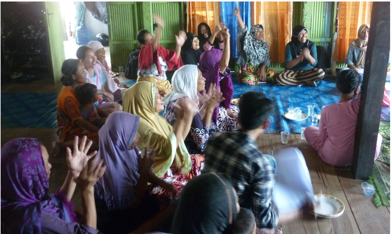
Women meeting in Tallo community, Makassar, May 2018

At the same time, due to the accumulation of mud and rubbish on the coastline, harvesting of shells, typically done by women, has sharply decreased. With their primary income-generating activity curtailed by beach contamination, women must work harder to meet their families' needs, while still maintaining domestic chores such as cooking, cleaning, feeding their husband and children, managing the community, and taking part in the decision making processes. To shoulder this triple burden (production, reproduction and social community management), women's work in this coastal community requires around 18 hours per day. 53 Ironically, their role is still considered to be complementary to, or supporting, men's work. Indeed, women are often not seen as fishers even though they play a key role in the pre- and post-harvest activities. Thus their voices have been heard even less than men's in the consultation process. 54